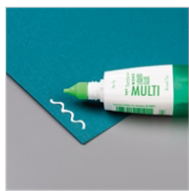
Multipurpose Liquid Glue 154974