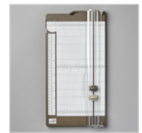
Paper Trimmer 152392