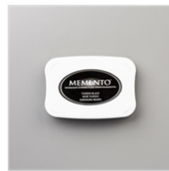
Tuxedo Black Memento Ink Pad 132708