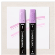
Fresh Freesia Stampin' Blends Combo Pack 155518