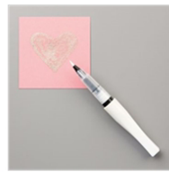
Wink Of Stella Clear Glitter Brush 141897