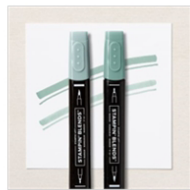
Soft Succulent Stampin' Blends Combo Pack 155521