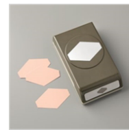
Tailored Tag Punch 145667