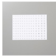
Rhinestone Basic Jewels 144220