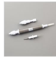
Take Your Pick 144107