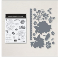
Hand-Penned Petals Bundle (English) 155492