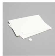
Stampin' Dimensionals 104430

Fiona Whitten – Independent Stampin' Up!® Demonstrator Email: fiona@oakfieldcrafts.com Blog: https://oakfieldcrafts.com