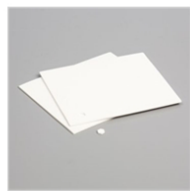
Mini Stampin' Dimensionals 144108