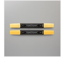
Daffodil Delight Stampin' Blends Combo Pack 154883