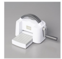
Mini Stampin' Cut & Emboss Machine 150673